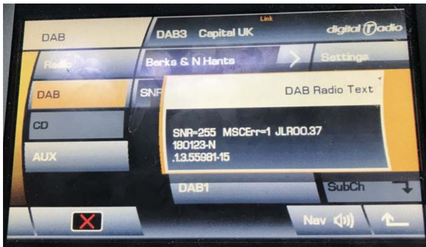
Gen 1 display