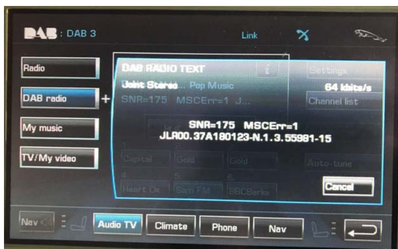
Gen 2.1 display